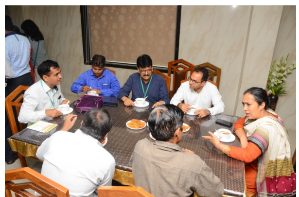
(p) Lunch break