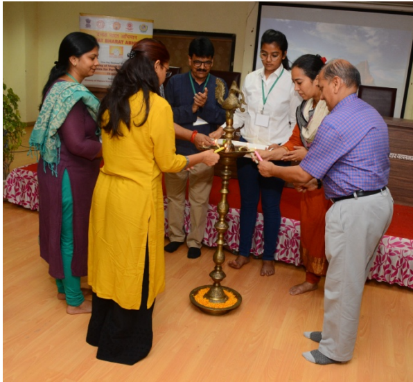
(c) Lamp lighting by dignitaries for inaugurating the function