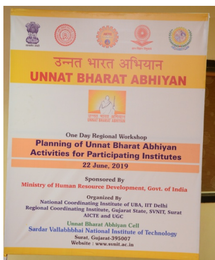
(a) Unnat Bharat Abhiyan banner