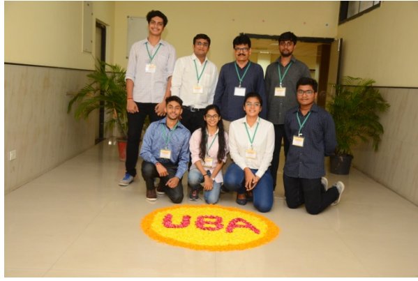
( q ) Floral rangoli at entrance