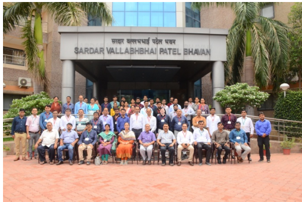
( r ) Group photo